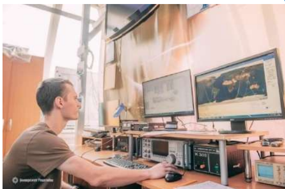
Reshetnev University Mission Control Center

University team welcome undergraduate and postgraduate students, young researchers and specialists to join International Summer School “Siberian Satellite Design School - 2025” to be held on 18th – 31st August 2025 in online / off-line mode.