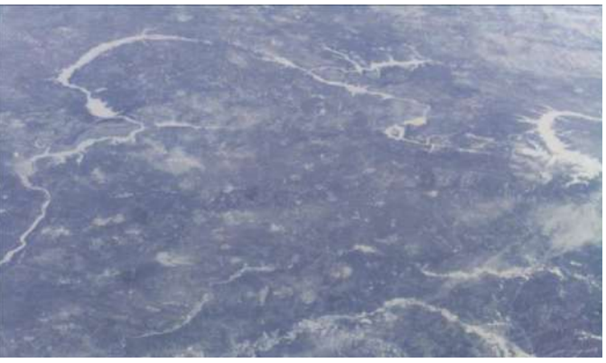
ReshUCube-1's Photo of Earth